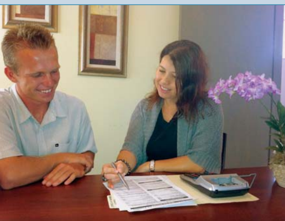
Hawaii First FCU staff assisting a member in their Community Resource Center.

The Hawaii credit union movement is firmly rooted in island values of ohana (family), laulima (working together), and lokahi (harmony within the group). Hawaii credit unions serve members spanning across the islands from Kauai to the Big Island. Programs range from offering one-on-one financial counseling services, to providing assistance, to helping local schools educate children on the basics of financial wellness. Many Hawaii credit unions use multiple resources to reach their members such as providing interactive online tools, offering financial counseling courses, and working with community organizations to form partnerships for addressing specialized needs of credit union members and the community at large.